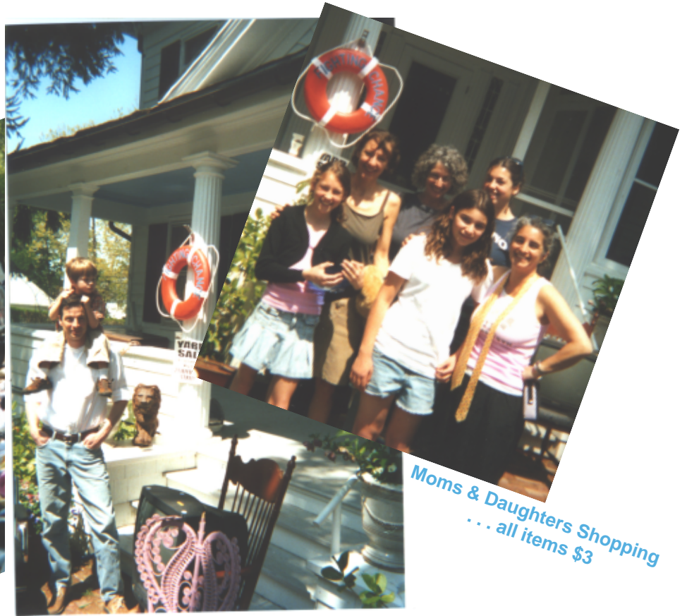
Moms & Daughters Shopping ... all items $3